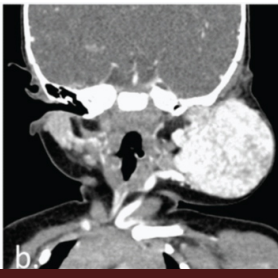
[Table/Fig-4]: Post-contrast images showed intense enhancement of the entire left parotid gland.

lobes and was hypoechoic with lobulated contours. [Table/Fig-2a]. There were large anechoic vascular channels noted within the lesion, which showed colour flow on application of doppler [Table/Fig-2b]. Few sub centimetric lymph nodes were noted in the surrounding region. The right parotid gland was normal in size, echopattern and vascularity. Ultrasonography of the brain was normal.