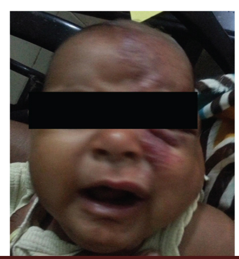
[Table/Fig-1]: Cutaneous hemangioma noted over the left side of face in the trigeminal (V1 and V2) distribution and a swelling in the left parotid region.

A 3-month-old female baby was brought to the Paediatrics outpatient Department with a swelling in the left parotid region since birth, which has increased in size recently. There was no fever or excessive crying. Antenatal history was unremarkable and the baby was healthy otherwise. On clinical examination, there was a non-pulsatile swelling in the left parotid region. There was a cutaneous strawberry hemangioma noted on the left side of face in the trigeminal (V1 and V2) distribution [Table/Fig-1]. General health of the baby was normal. Blood counts and CRP was within normal limits.