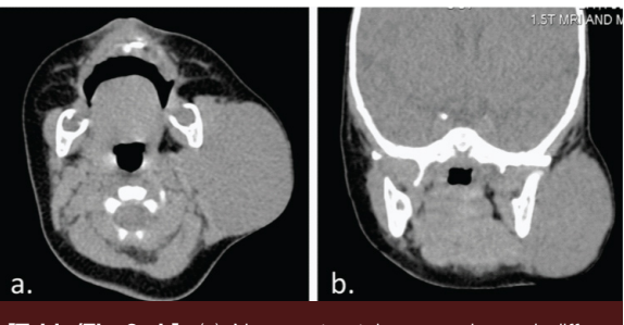
[Table/Fig-3a,b]: (a) Non-contrast images showed diffuse enlargement of superficial and deep lobes of left parotid gland with lobulated contour. (b) There was no evidence of any pressure changes in the form of erosion or scalloping in the underlying mandible.

Sonography of the left parotid region was performed on Philips iU22 machine using a 7.5 MHz frequency linear array transducer. The left parotid gland was enlarged in size involving both the superficial and deep